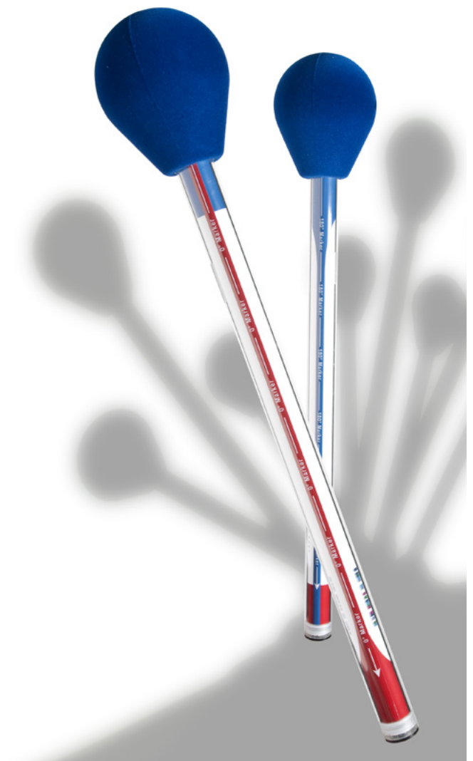
POD antennas for the frequency range 1-18 GHz