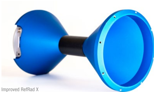
Improved RefRad X