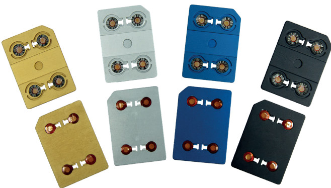
Different colors available.