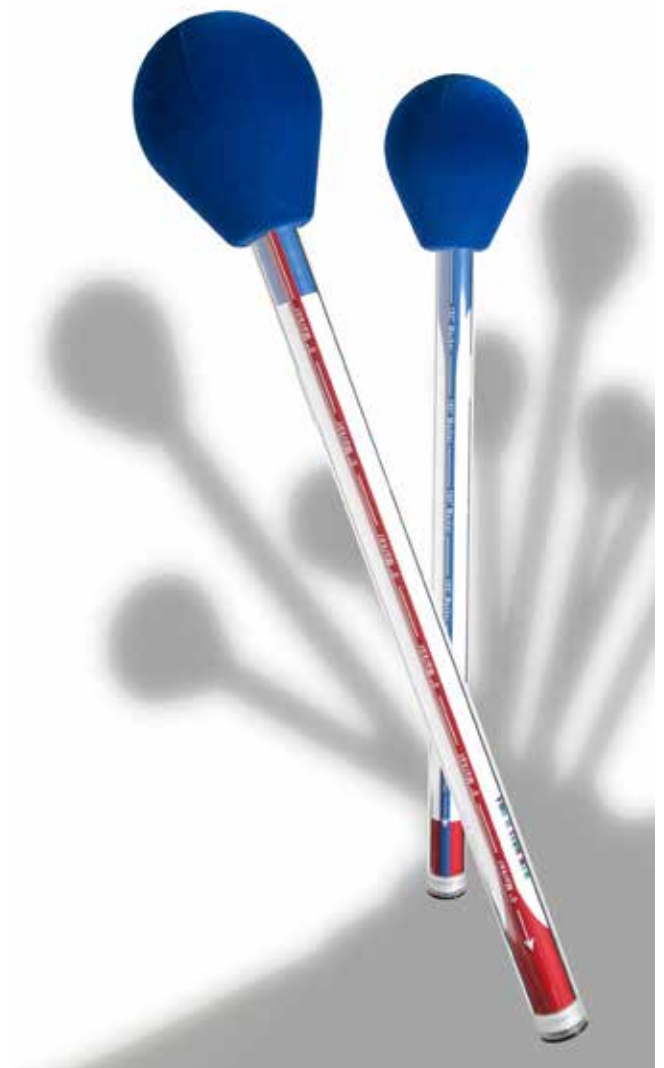
POD antennas for the frequency range 1-18 GHz