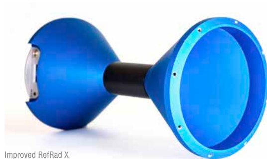
Improved RefRad X